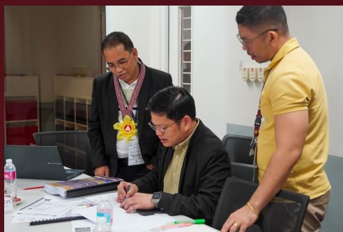
CoEd eyes bachelor's program on culture and arts offering