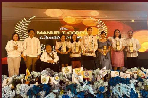
TSU is top 1 in AACUP's Level IV 'retained' program accreditation, QA director bags 'quality advocate' award