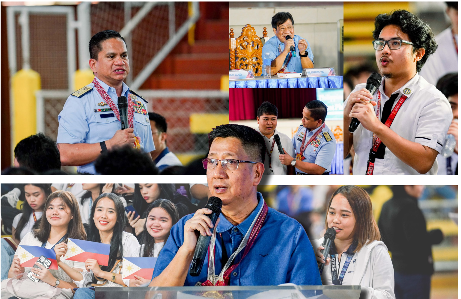
IN PHOTOS: "KILOS KABATAAN PARA SA WEST PHILIPPINE SEA" FORUM OF THE NATIONAL YOUTH COMMISSION, PHILIPPINE COAST GUARD, PHILIPPINE INFORMATION AGENCY, AND TSU