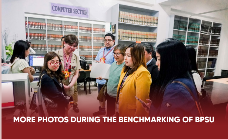
MORE PHOTOS DURING THE BENCHMARKING OF BPSU